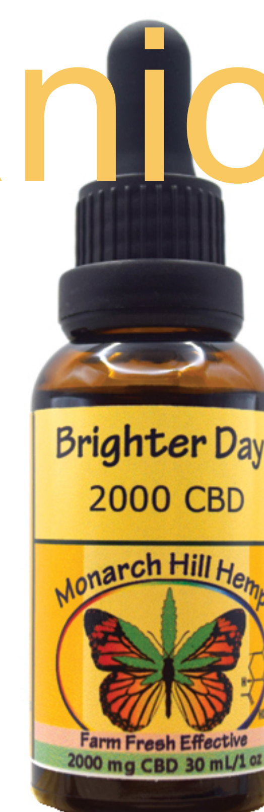
Sample Intake Photo