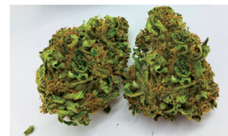
Sample Intake Photo

Analysis Method: GC FID Total THC = (0.877 x THCA) + delta 9 THC Total CBD = (0.877 x CBDA) + CBD Total CBG = (0.877 x CBGA) + CBG ND + None Detected