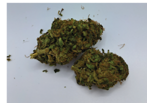
Sample Intake Photo

Analysis Method: GC FID Total THC = (0.877 x THCA) + delta 9 THC Total CBD = (0.877 x CBDA) + CBD Total CBG = (0.877 x CBGA) + CBG ND + None Detected