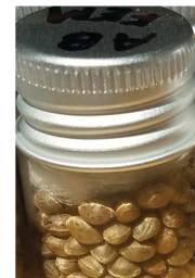
Sample Intake Photo

Analysis Method: GC FID Total THC = (0.877 x THCA) + delta 9 THC Total CBD = (0.877 x CBDA) + CBD Total CBG = (0.877 x CBGA) + CBG ND + None Detected