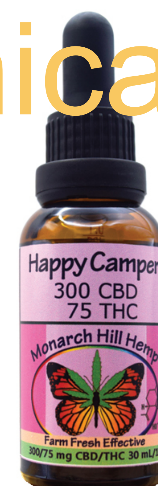
Sample Intake Photo