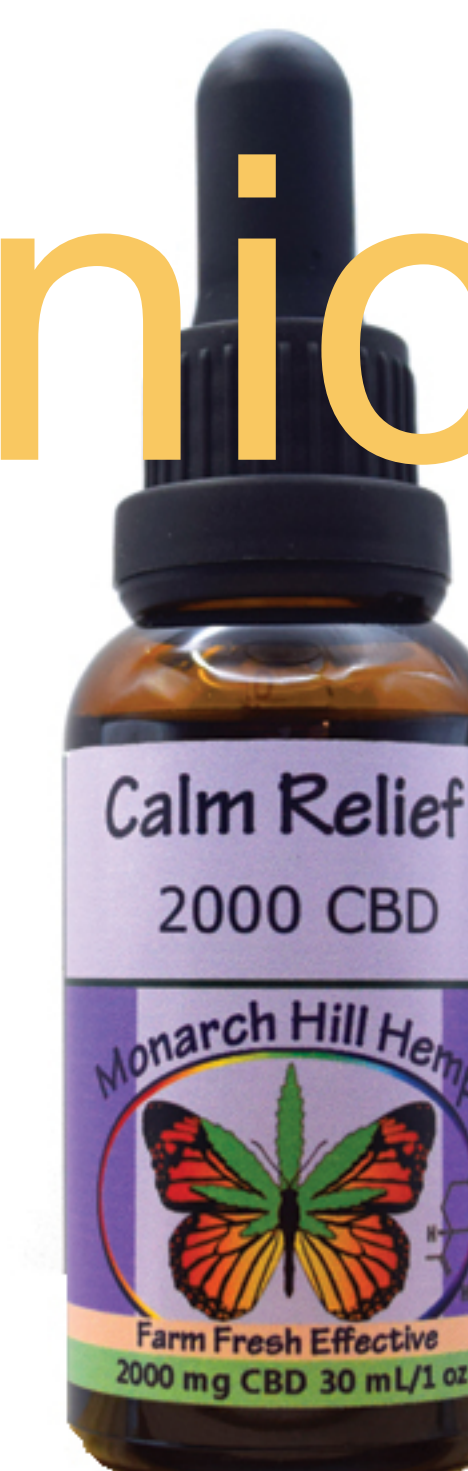
Sample Intake Photo