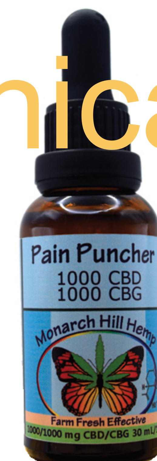
Sample Intake Photo