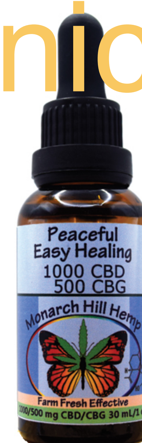
Sample Intake Photo