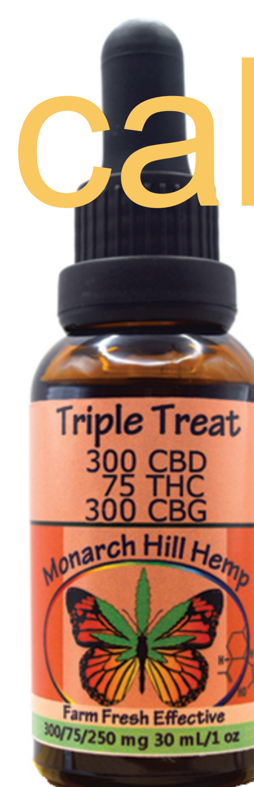
Sample Intake Photo