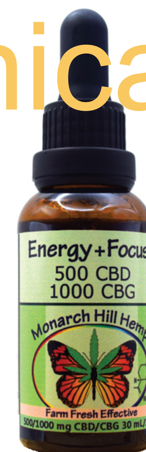
Sample Intake Photo